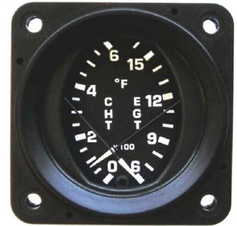
P/N 010-328-0 SCALE: 1/1