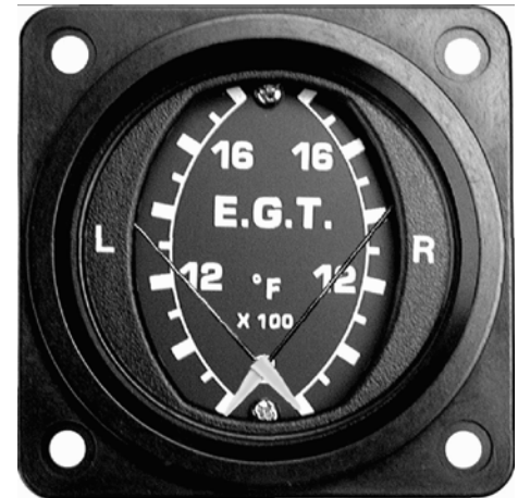
P/N 010-311-0 SCALE: 1/1