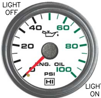
P/N 101-104-2R-1 SCALE: 3/4