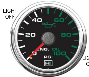
P/N 101-104-4R-2 SCALE: 3/4