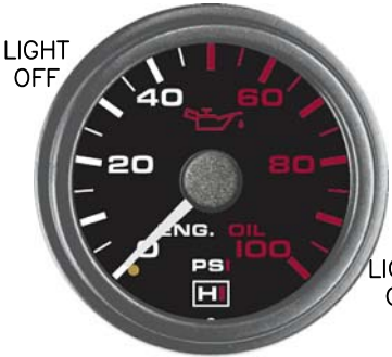
P/N 101-104-3W-1 SCALE: 3/4

DIAL FACE COLORS POINTER COLOR BEZEL COLOR & STYLE