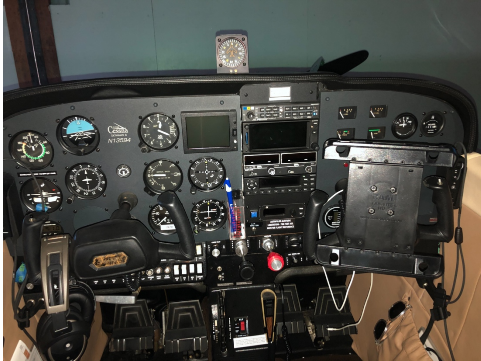
A Cessna 1973 Cessna 172M before starting upgrade