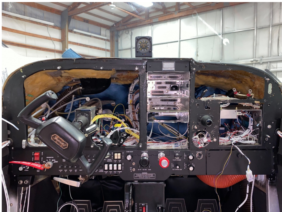
Any plastic panels, shock panels, instruments, and avionics, and components must be removed