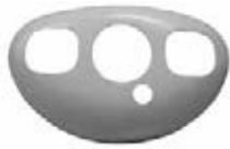
PA 12 & 14