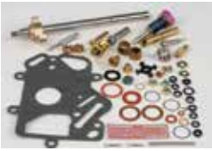
This image is for reference only. Kit contents may differ per kit

Marvel-Schebler "Quick Kits" are easy to use, and are designed to save you time and money. Quick Kits include not only the recommended replacement parts used in every overhaul, but the additional parts used by all fuel professionals to insure the job is done right.