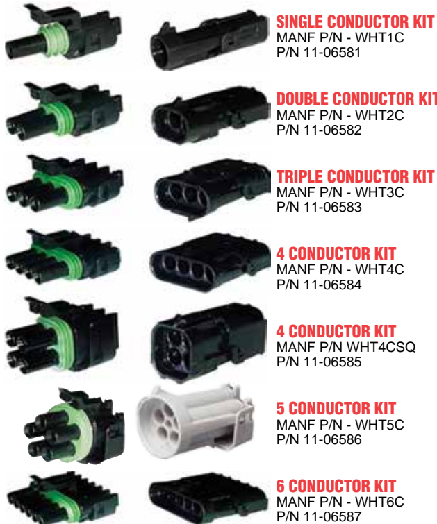
SINGLE CONDUCTOR KIT MANF P/N - WHT1C P/N 11-06581