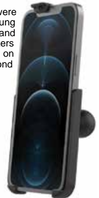
RAM® Form-Fit Cradle for Apple iPhone 12 & 13 Pro Max with Ball P/N 11-19216

These high-strength composite, form-fit cradles were designed specifically for the Apple and Samsung devices. Allowing for one-handed docking and removal, all buttons, cameras, ports, and speakers are left exposed. With the two-hole AMPS pattern on the back of each cradle, attach to a RAM® diamond ball base and additional RAM® components.