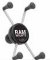
RAM® X-Grip® Large Phone Holder with Ball P/N 11-12987