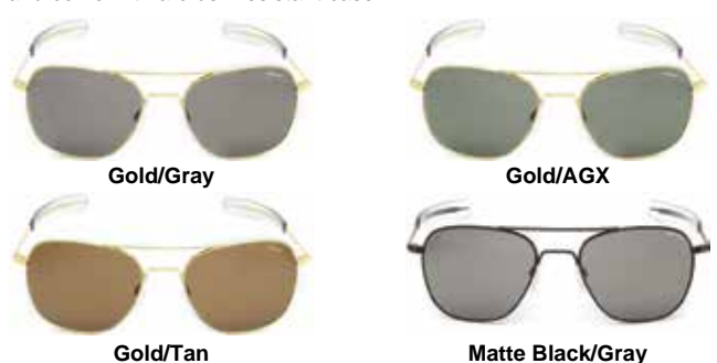
AVIATOR – Standard issue for military pilots worldwide. (MIL.SPEC. 25948). These lenses sharpen detail and show colors evenly, making them ideal for flying. Bayonet temples provide optimum fit for use with a headset or helmet.

Randolph Engineering has been a leading supplier of military sun-glasses to the U.S.Armed Forces since 1982. These sunglasses are the choice of America's Top Gun pilots and NASA astronauts. They meet demanding U.S. military specifications, provide superior glare protection and UV absorption and can be converted to prescription lenses. All of the sunglasses below feature 23K gold plated, hand polished frames and come with a crush resistant case.